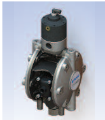
Stainless Steel model with Surge Chamber (for applications where fluid filter will shear fluid). Order DX200SP.