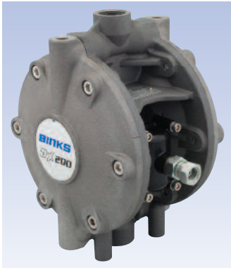
Unregulated DX200 provides users with a vertical fluid outlet.

Pump outfits include a mounting option and are fitted with a flexible suction wand and suction strainer on the vertical bottom inlet. A rigid suction tube is used when pail mounted. The unregulated model has a vertical top outlet, while the fluid regulated model is a front horizontal outlet.