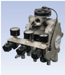
"Built-in" fluid regulator saves money compared with competitive products.

The end cap and air valve cover fixings are unobstructed and can be removed with a single tool, enabling pump maintenance to be performed wherever it is located.